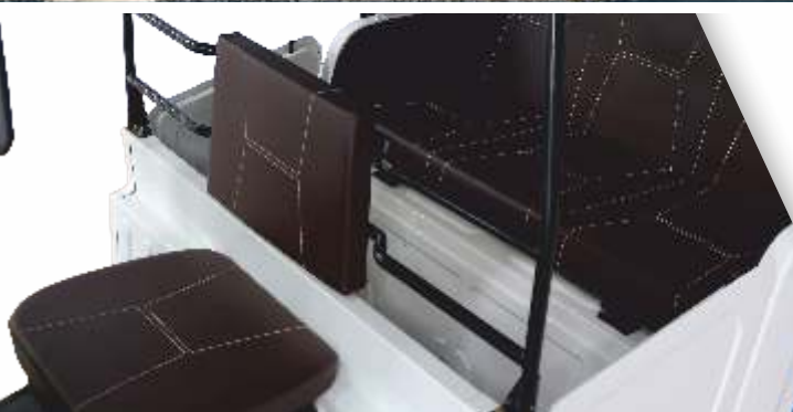
SPACIOUS DRIVER & PASSENGER CABIN